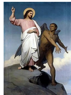
Who will be your King?

( Gen 3; 6-8; Job 1:6-12; Isa 14:12-14; Ezek 28:12-18; Dan 7:9; Rom 1:19-32; 3:4; 5:12-21; 8:19-22; 1 Cor 4:9; Heb 1:14; 1 Peter 5:8; 2 Peter 3:6; Rev 12:4-9. )