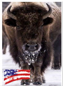
Lamb like Beast out of the earth around 1798

Today, most “Protestants” haven’t studied Bible prophecy and/or have forgotten past persecutions & continued blasphemous claims of the Little Horn Power . Some no longer identify as ‘Protestant’ saying the protest is over. The majority of Christianity will accept counter reformation lies such as the Antichrist came in the past or will come in the future; Ignoring the past, Apostate Protestants will come to accept the Pope as the leader of Christianity, accepting his unbiblical doctrines & incorporated pagan traditions. ‘Mother and Daughter Harlots’