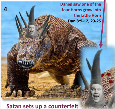
Daniel saw one of the four Horns grow into the Little Horn Dan 8:9-12, 23-25

Iron kingdom of Rome, dreadful, terrible, huge iron teeth, bronze claws, exceedingly strong, chews & tramples everything in its path.