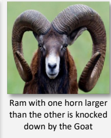
Ram with one horn larger than the other is knocked down by the Goat